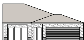
Typical North Elevation