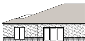
Typical South Elevation