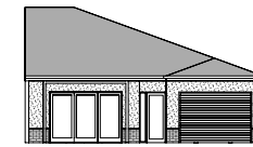
Typical North Elevation