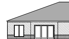
Typical South Elevation